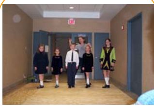
Step Dancers & a Bag Piper helped us celebrate 5 years!