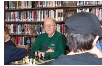
Chess lessons anyone?