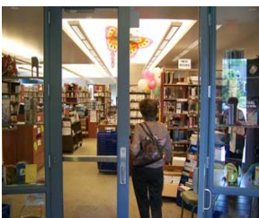
Come in, you are welcome here!